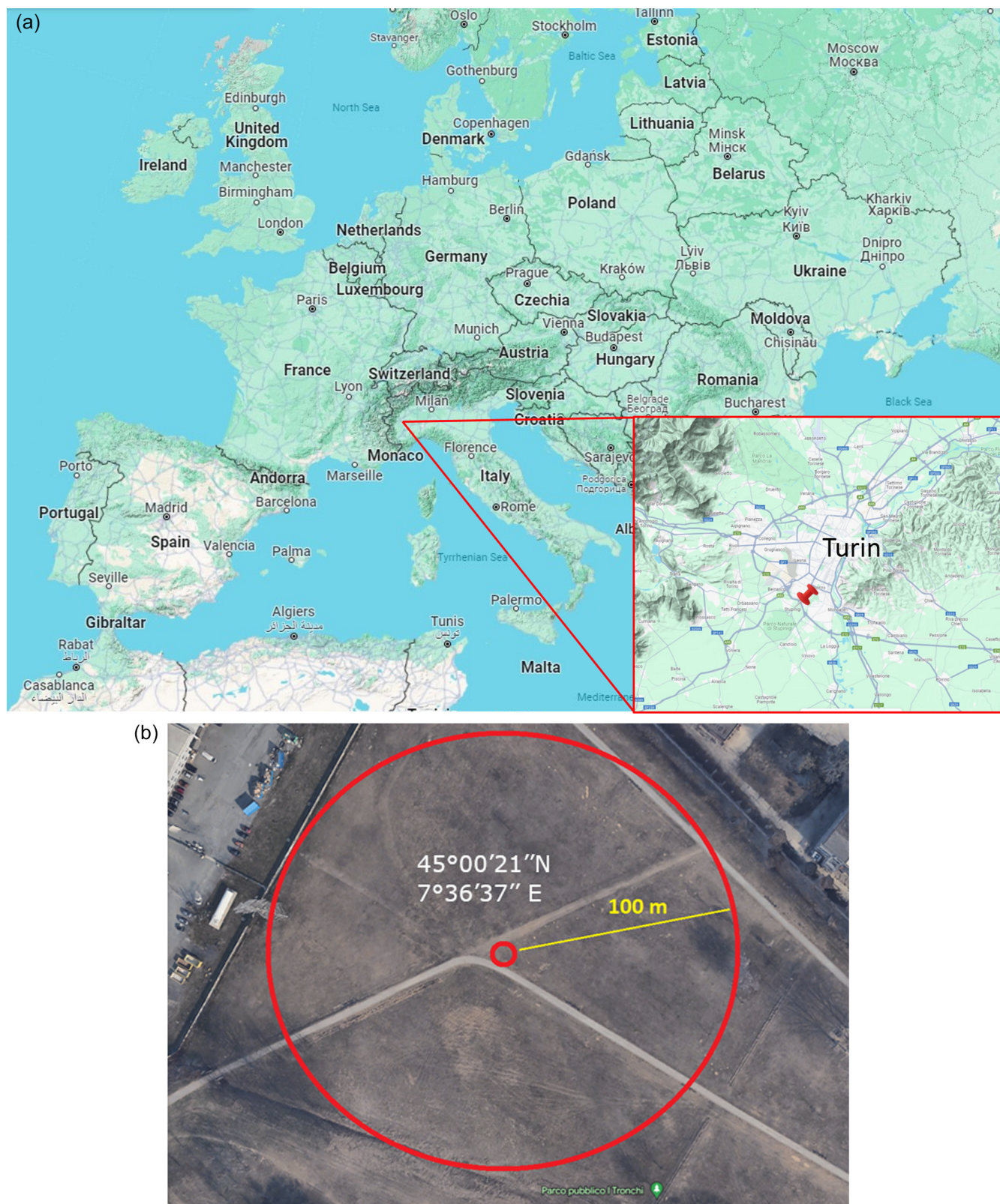
FIGURE 1 (a) Google Maps picture identifying the location of the site selected for the reference station. (b) Google Earth picture of the site, with the 100 m radius free of obstacles around the station, positioned in the centre of the red circle. The coordinates of the station are reported in the picture. It is worth mentioning that all trees have been cut in the area internal to the red circle, according to the WMO prescriptions, in order to reduce uncertainties in the data representativeness and measurement errors.