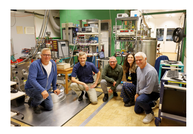
Fig. 1. METAS laboratory with the authors and the three installed bridges: from left to right, METAS DJIB, CMI FDIB, INRIM-POLITO FDIB.

The CMI FDIB is based on the reconfigurable bridge [4], where the reference ratio of the bridge is formed by the ultrastable two-channel generator SWG [5]. The 4TP definition of the impedances under comparison is fulfilled by means of additional sources and injection circuit. In the 1:1 ratio mode, a two-step measurement is performed, where rebalancing in the second step is done with an additional injection circuit situated in one of potential arms. The full automation of the bridge balancing and reversing of sources is performed with the second generation of coaxial switches based on [6]. High stability of channel outputs and low crosstalk between two reference channels (both around 10^{-8} \, \text{V/V} ) ensure negligible influence of channel swapping and phase rotation of one