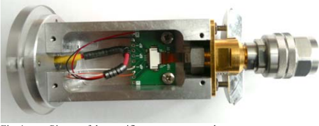
Fig. 1. Picture of the specific sensor mount under test.

original device compatible with the 7 mm coaxial microcalorimeter.