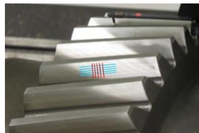
Figure 1. Scan paths along the gear tooth: involute direction (red); helix direction (blue).

vertical extent of the tooth profile with the measuring range of the profilometer.