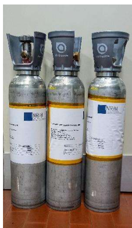
Figure 3: Examples of INRiM reference gas mixtures for CO 2 amount fraction and isotopic composition.

Transform Infrared Spectrometer - FTIR (Nicolet iS50, ThermoFisher Scientific, USA) equipped with a mercury cadmium telluride (MCT) detector and a 2 m White type gas cell. This reference gas mixture was sent to the Max Planck Institute for Biogeochemistry (MPI-BGC) for the verification of the isotopic composition by isotope-ratio mass spectrometry (IRMS) and the value was consistent with the one reported by INRiM, within the declared uncertainty. Figure 3 shows some of the cylinders which were analysed at MPI-BGC for the validation of their isotopic composition.