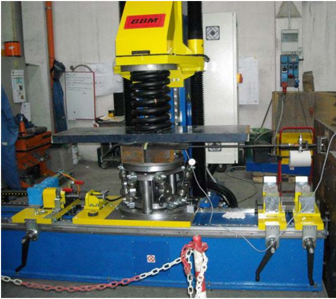
Figure 5. The second multicomponent spring testing machine by BBM during machine verification tests.

displacement and a lower movable bench aimed to detect the displacement along the transverse axis with a resolution of 0.01 mm. The HS MCFMT is placed upon the lower movable bench. Before starting the test, the springs are manually placed between the loading pad of the movable crossbar and the upper plate of the HS MCFMT, and centered by means of a caliper. The huge friction between the contact surfaces guarantees that no shifts nor slips occur. For the measurement of the side forces (and moments) generated by the spring under load, a hardened steel bar is used in order to fix the HS MCFMT and the lower bench to the base of the spring testing machine. The steel bar is then removed to measure the displacement along the transverse axis.