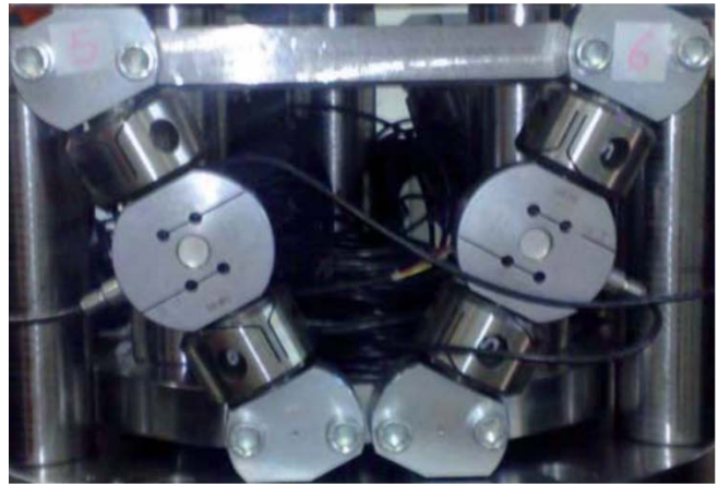
Figure 2. A pair of inclined UFTs with elastic hinges and clamping heads at both ends.

\alpha , \beta , \gamma and \delta angles are 55^\circ , 62.5^\circ , 60^\circ and 30^\circ respectively. The six UFTs have a capacity of 75 kN. These values entail a vertical force capacity of 400 kN, side force capacities of 100 kN, and moments capacity of 50 kN·m. Maximum deformations of the structure under the highest load are in the order of few millimeters. The six UFTs are connected to an external amplifier, which provides the required supply voltage to the transducers and acquires data.