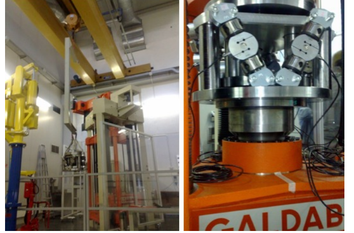
Figure 3. The HS MCFMT during the first calibration in the 1 MN deadweight FSM at INRiM.

the geometrical parameters described in Eq. (1) and by propagating them according to GUM [11], it is possible to get the overall uncertainties for the different forces and moments components. It is found that the uncertainties at maximum load for each component are 0.16 kN for transverse forces F_x and F_y , 0.43 kN for vertical force F_z , 0.07 kN·m for M_x , 0.10 kN·m for M_y , and 0.05 kN·m for M_z [4,12].