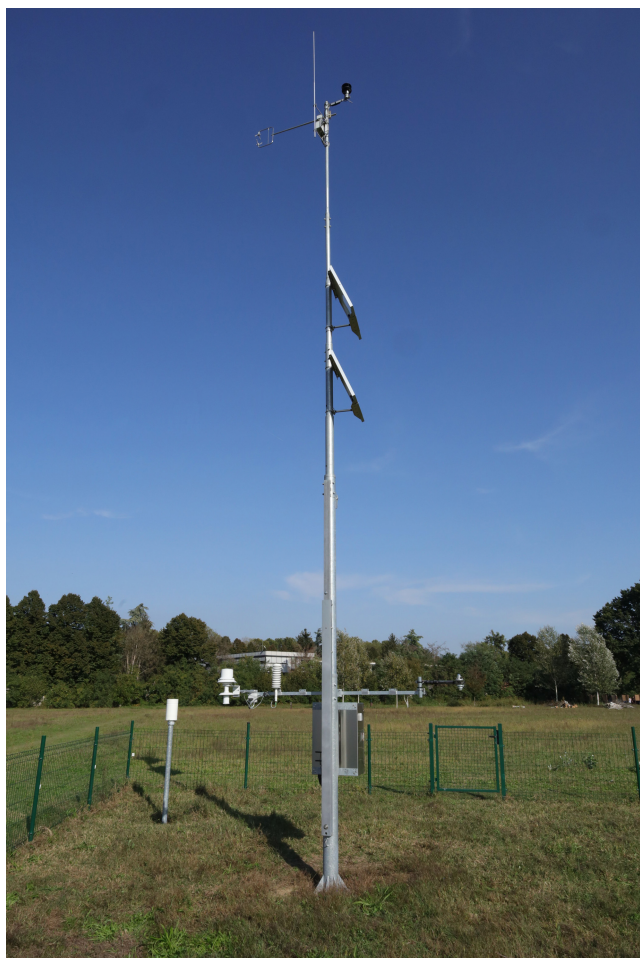
FIGURE 2 Picture of the Climate Reference Station.

The station is based on the instruments, reported in Table 3, and an associated datalogger with transmitter.