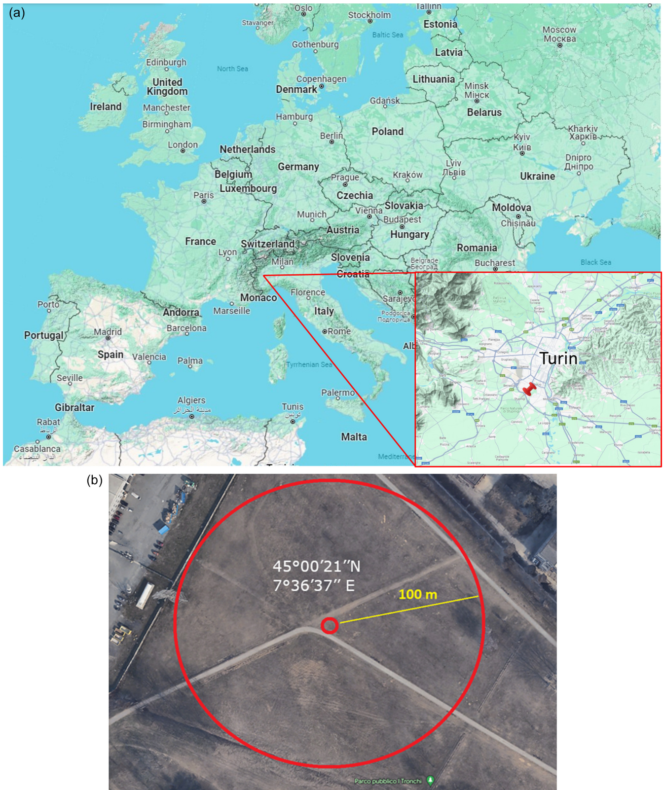
FIGURE 1 (a) Google Maps picture identifying the location of the site selected for the reference station. (b) Google Earth picture of the site, with the 100 m radius free of obstacles around the station, positioned in the centre of the red circle. The coordinates of the station are reported in the picture. It is worth mentioning that all trees have been cut in the area internal to the red circle, according to the WMO prescriptions, in order to reduce uncertainties in the data representativeness and measurement errors.