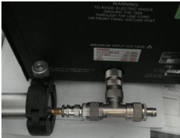
Fig. 1. Short connection of the TVC to the JAWS inside the pulse-tube cryocooler through the vacuum-tight SMA feedthrough.

In the TVC quantum-based calibration method, the TVC input is connected to the JAWS output, then a proper sequence of different calculable and quantum-defined voltage signals are applied to TVC input. Finally, the TVC output is measured with a high-resolution dc nanovoltmeter. Since the pulsed Josephson standard can generate signals with any arbitrary shape, a wide range of possibilities are available to analyze the TVC behaviour. The typical test follows the sequence dc-ac-dc: by comparing the response in ac with the average of values for dc of opposite polarities, the ac-dc difference can be accurately obtained with drifts and offsets reduction. In some cases, it can be preferable to observe difference in the response to signals at different frequencies, to determine the, so called, ac-ac difference. Sometimes, to eliminate the dc reversal error and other electrothermal phenomena, more sophisticated procedures are used to determine the ac-dc transfer such as