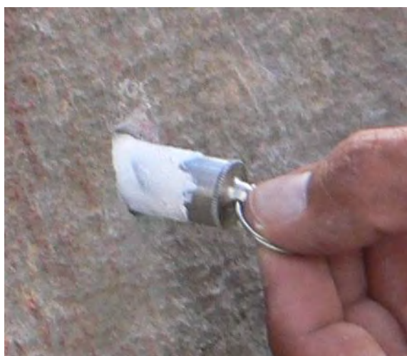
Figure 1. Inserting a TDL in a Calcschist rock.

The TDL have been inserted into different types of rock at 10 cm depth (Fig. 1). The acquisition interval is every 10 minutes in summer and every 30 minutes in the other seasons (Fig. 1).