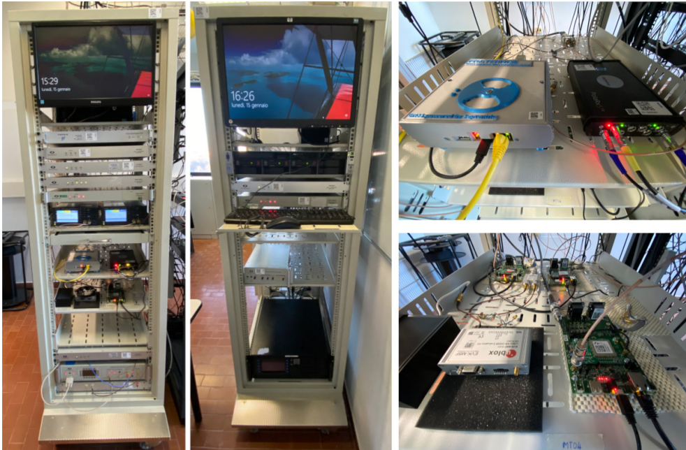
Fig. 1 FRATERNISE Facility at the INRIM RadioNavigation Laboratory. On the left is a general view of the two racks composing the Facility, while on the right are details of the facility’s calibrated GNSS receivers for timing applications used for synchronizing to UTC(IT) remote fundamental physics experiments. Such receivers will be employed to evaluate the CTS time transfer capabilities when SCMs are located remotely at a final user and to test the satellite-CTS feature to extend GNSS-based timing systems in areas not covered by GNSS RF signals, like indoor, underground, and underwater environments.