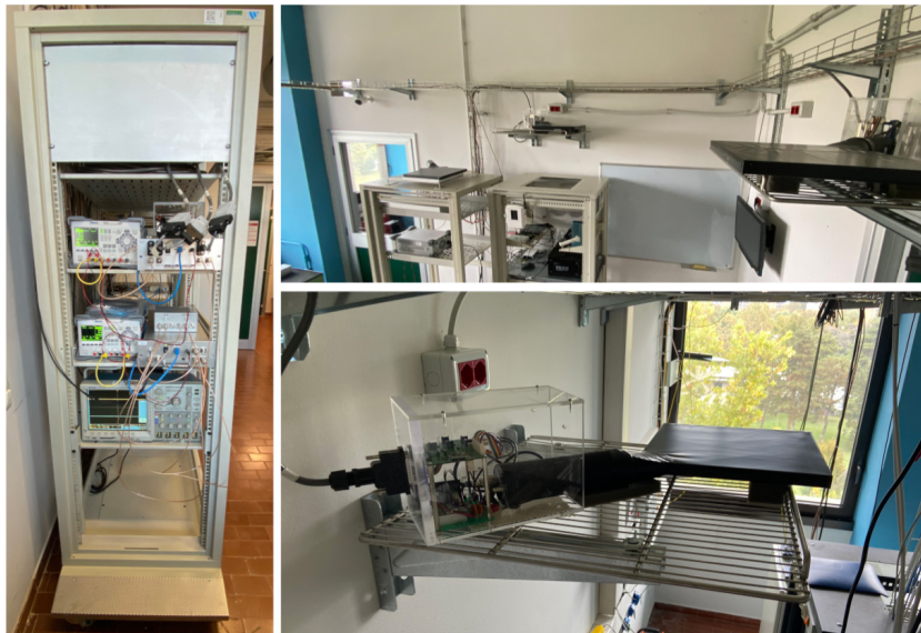
Fig. 3 CTS setup at INRIM RadioNavigation Laboratory. On the left is a view of the rack hosting the CTS power supply system, MCS and SCMs TDCs, and ancillary measurement systems. The details of the 30 cm \times 30 cm plastic scintillators, PMT (Photo Multiplier Tubes), and HV (High Voltage) units are on the right.

state-of-the-art time metrology measurements systems operated at the INRIM Time and RadioNavigation Laboratories. Based on these results, the first tests to discipline the AHM to UTC(IT) and disseminate a UTC(IT) replica (i.e., UTC(IT)_CTS) remotely with the short-term characteristics of the AHM and the medium-long term one of UTC(IT) have been started. Although preliminary, the results achieved are encouraging (Cerretto et al. , 2024b), showing CTS can generate a UTC(IT) replica remotely within 5 m below the two nanoseconds to UTC(IT) in terms of precision. From these results, further studies have started, based on moving one of the three SCMs 30 m far away and considering as SCM reference the time and frequency signals provided by a FRATERNISE commercial Rubidium clock.