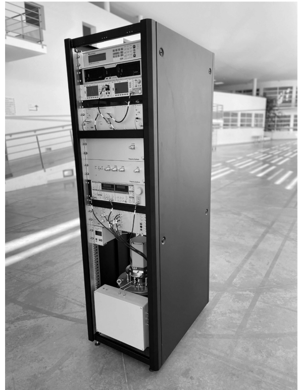
FIG. 1. View of the CSO. The cryostat is integrated at the bottom of a 19 in. rack supporting also the frequency synthesis and the control electronics.

For the measurements described here, U10 was implemented in the laboratory workshop equipped only with the standard air-